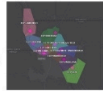
our work sites w/ ADB

This project required working around the customer's schedule to include Overnight Labor