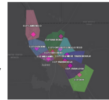
our work sites w/ ADB

This project required working around the customer's schedule to include Overnight Labor