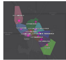
our work sites w/ ADB

This project required working around the customer's schedule to include Overnight Labor